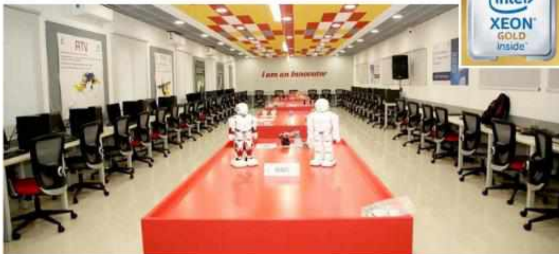
View of the Robotics Lab

AI lab is a boon to implement the policies of NEP in letter and spirit.